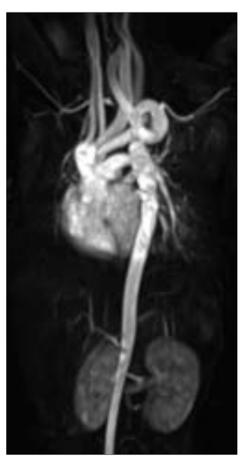
Figure 3. Contrast-enhanced 3D MRA demonstrating the remainder of the descending thoracic and abdominal aorta showing normal caliber and course.

ments of the third and fourth arches and the dorsal aorta, with migration of the arch from the cervical to the thoracic region (3). Theories regarding the etiology of the cervical aortic arch include persistence of the second or third branchial arch and resorption of the fourth arch, which normally forms the aortic arch; failure of the normal fourth arch to descend into the neck; and fusion of the third and fourth arches and failure to descend into the neck (1).